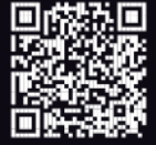
RUT951 360° VIEW

// RUT951 took the best features from one of the most popular Teltonika Networks cellular routers - RUT950.